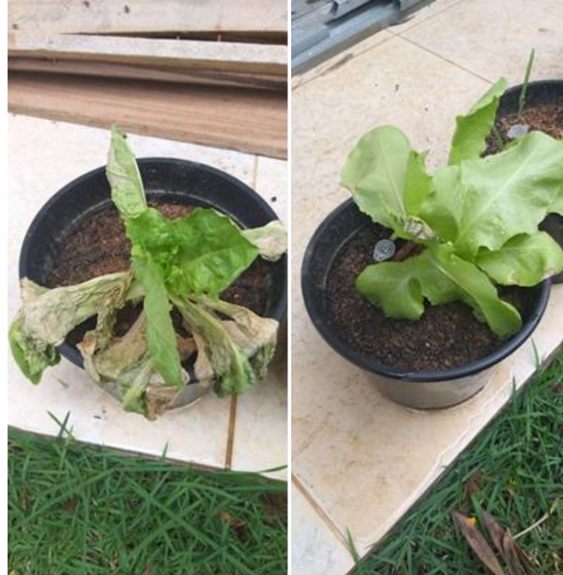
Figure 6. Left image, the lettuce in a very bad state, wilting and dying. Right image, the lettuce with the small bottles filled with CO 2 GANS placed in the soil close to the lettuce, and now the lettuce fully recovered.

Small plastic vials of CO 2 Gans was placed in the soil of a dying potted lettuce plant, and after some time it was fully restored (Figure 6).