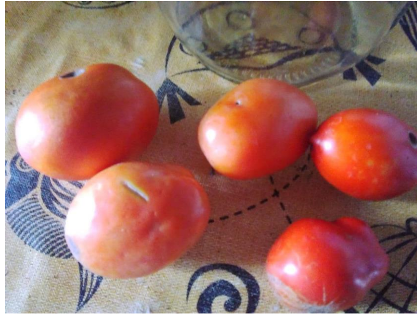
Figure 2.1. Tomatoes without Gans water and with Tomato drill disease