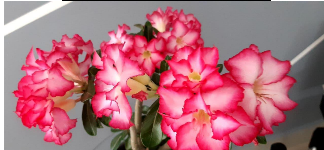
Figure 4. Top Left image, Aug 2020, the Roses are depleted with a yellowish color in the stem and almost dead. Top Right image, Feb 2021, Roses have fully recovered after the use of the Gans water of the Cup #1.