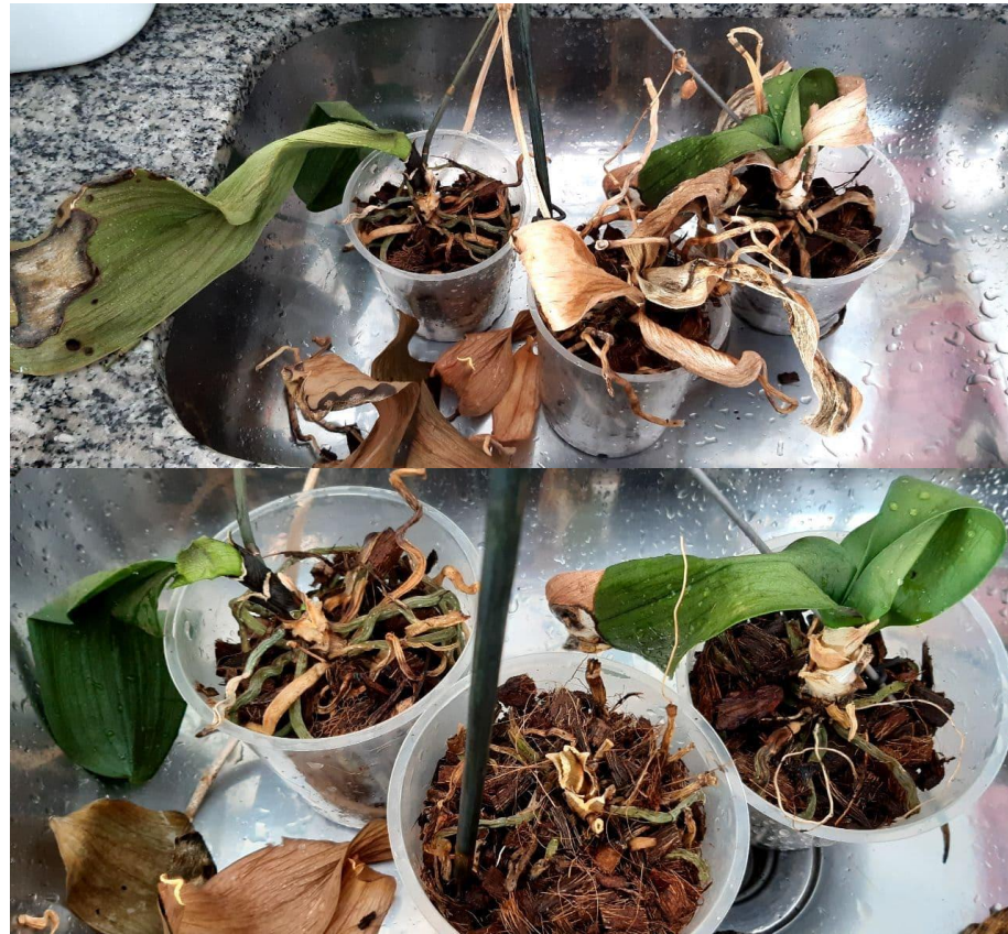
Figure 3.1. Top image on Feb 12, 2021, left side of image you can see the wilted leaves. Bottom image on Feb 15th 3 days later, you can see the leaves turning more green and coming back to life.