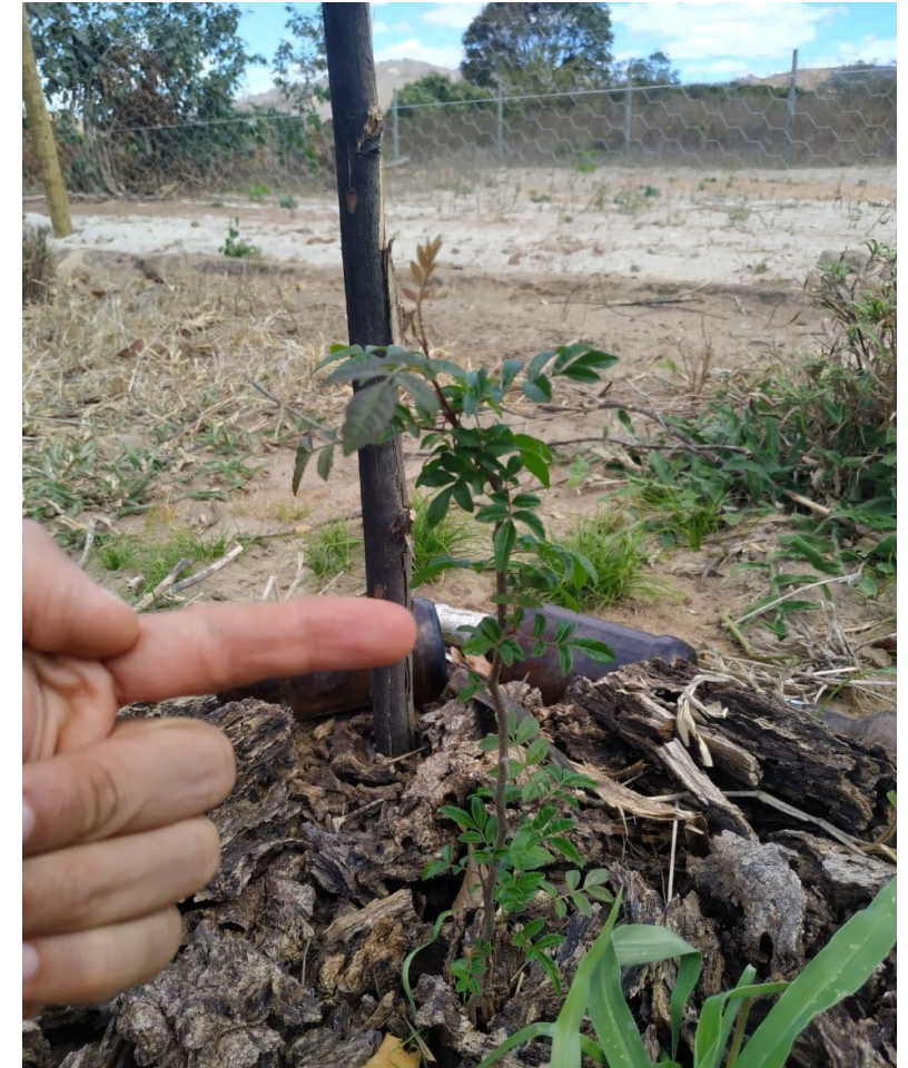
Figure 7. Left side, the day bottles with GANS were placed in a star formation. Right side, some weeks later you can see how beautiful the leaves are growing.