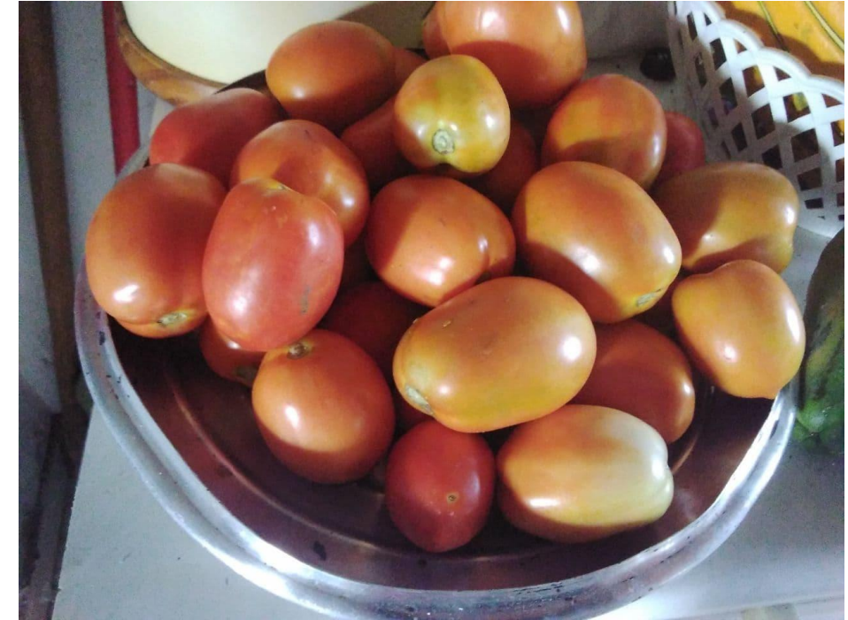
Figure 2.2. Tomatoes sprayed with Gans water and without any disease and much tastier, and beautiful looking.