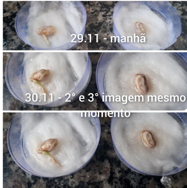
Figure 5.1. Left side Seed soaked in Gans water, Right Side, seeds soaked in regular water. First image Nov 29th, Gans water seed already sprouting, but not the regular water seed. The next day Nov 30th the same.