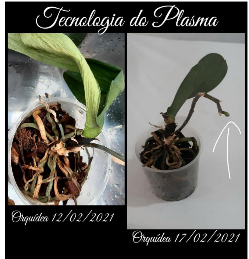
Figure 3.2. Left image Feb 12, 2021, you can see the wilted Orchids. Right image Feb 17th after 5 days, the Orchid has come back to life and the leaves are more green and full.