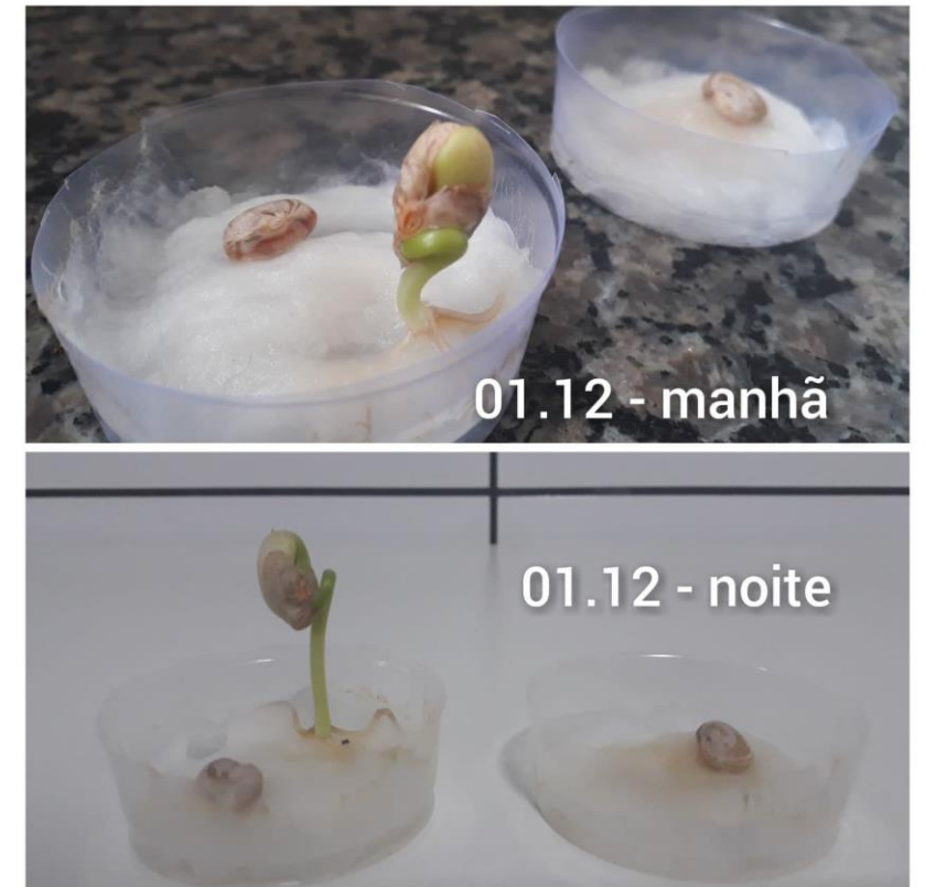
Figure 5.2: 3 Days later on Dec 1st. Left side, the seed soaked with GANS water from Cup#1 is already growing, while on Left side, the seed with regular water has not even sprouted yet. By the morning of Dec 1st Gans water seed is already growing roots, but other one has not even sprouted.