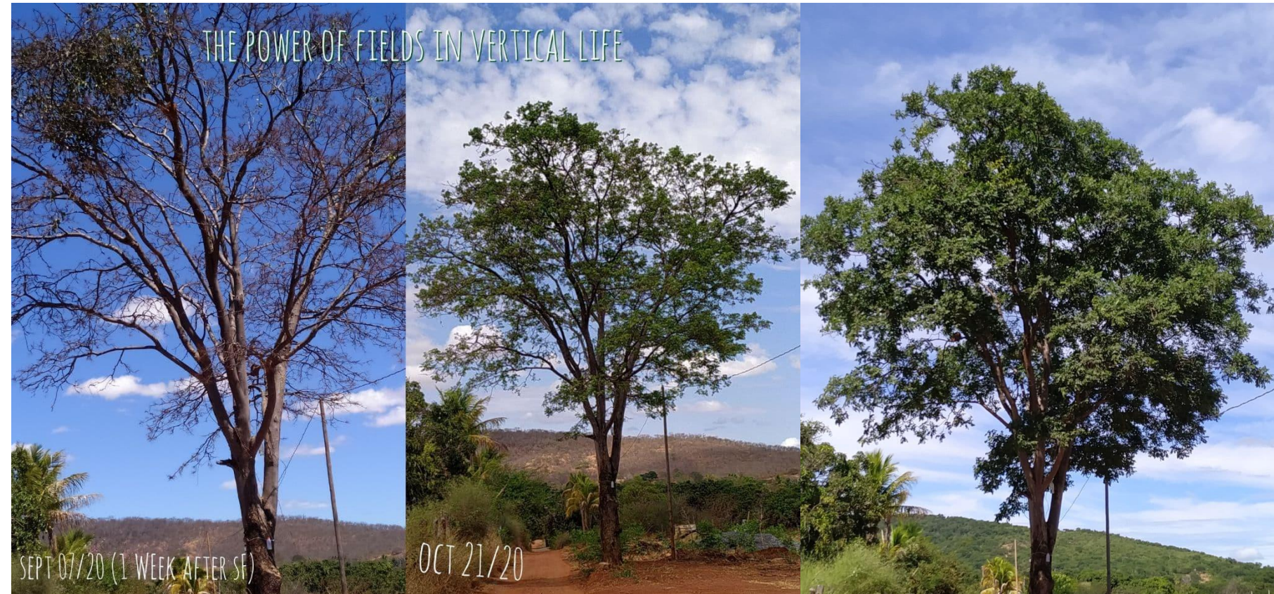
Figure 8: Left side; Sept 2020 - Before the star formation was placed at the tree it was almost without leaves, and now the leaves already coming back; Center image, 1 month later, most of the leaves have come back; Jan 2021; the tree is fully recovered and thriving.