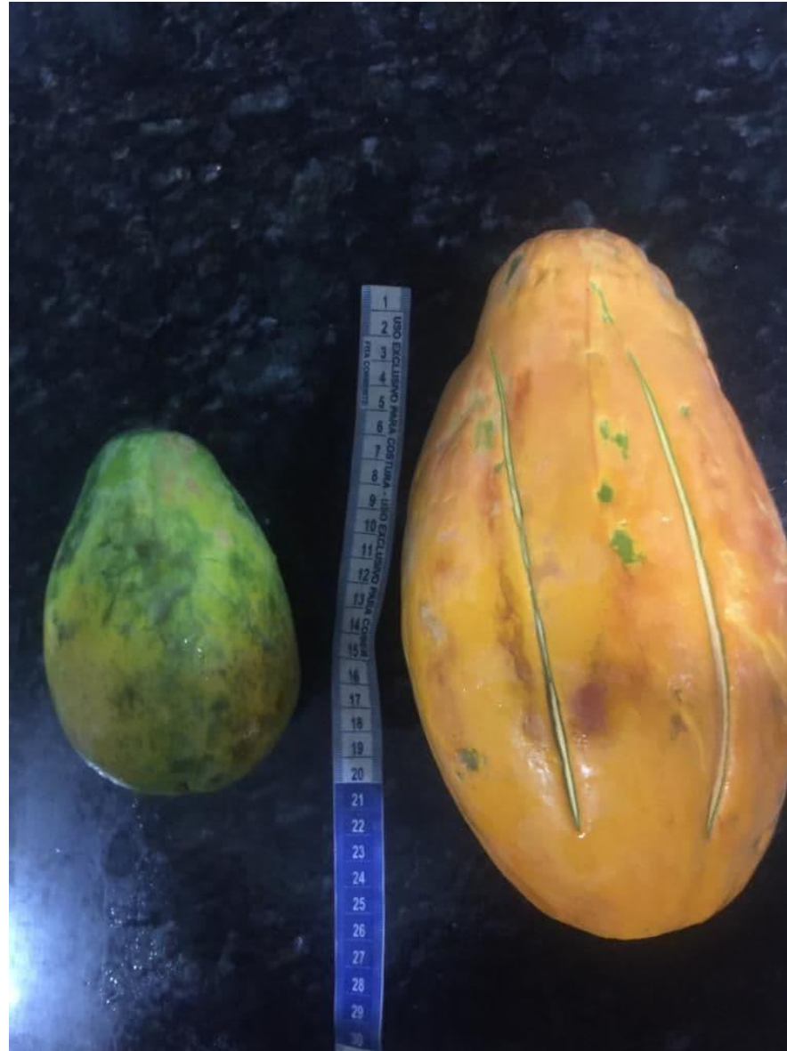
Figure 1. Left side: GMO Papaya without Gans water - measures about 12cm. Right side: After Gans water spraying the papaya went back to original size of 30 cm.